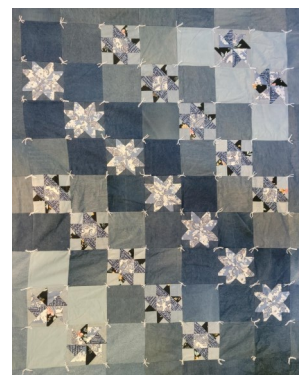
"Trail of Stars"